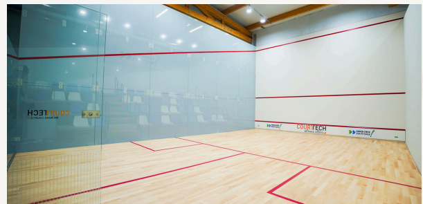
court #1 and stands