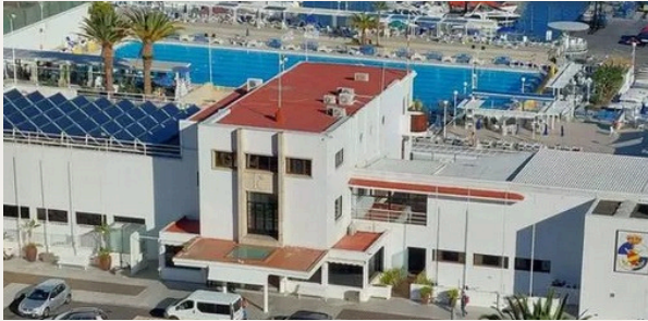
social building & pool

Event headquarters: 2 courts, changing rooms, gym and pool facilities, food area, relaxation area, and VIP zone