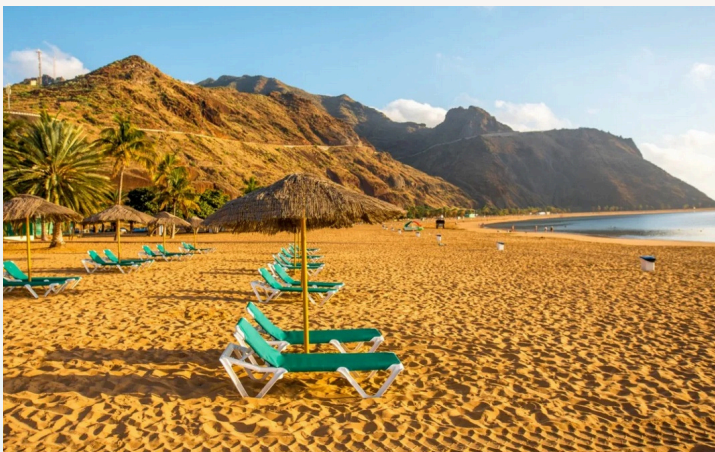
Playa de las Teresitas