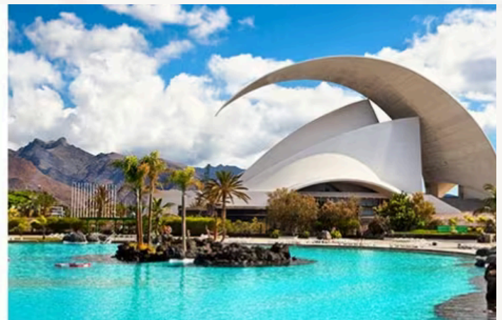
Parque Marítimo & Auditorio

Santa Cruz de Tenerife, the capital of the island and host city of the Spanish Junior Open 2026, is a place where competition meets the beauty of the sea, the warmth of the climate and the energy of a vibrant city. With its nearby beaches, welcoming atmosphere and relaxed lifestyle, it offers an experience that goes beyond the tournament for players, families and fans alike.